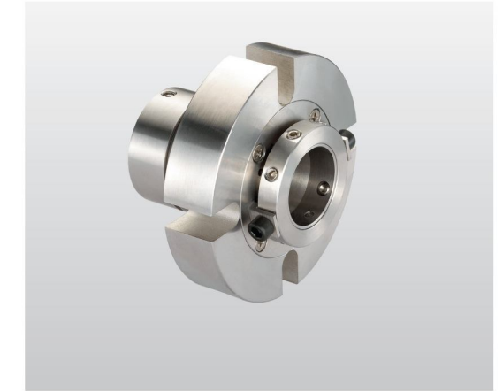
METEX Replace Burgmann METEX